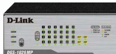
PoE usage LEDs

The DGS-1026MP features 24 10/100/1000BASE-T ports that support the IEEE 802.3at+ PoE standard. Each of the 24 PoE ports can supply up to 30 W, with a total PoE budget of 370 W, allowing users to attach multiple IEEE 802.3at-compliant devices to the DGS-1026MP without requiring additional power sources. Power over Ethernet is especially suitable for powering devices that are too far away from power outlets or for minimising the clutter of extra cables. The PoE usage LEDs further provide real-time feedback on the current PoE power usage on the network and helps plan out the PoE network budget, preventing PoE overloading problems.