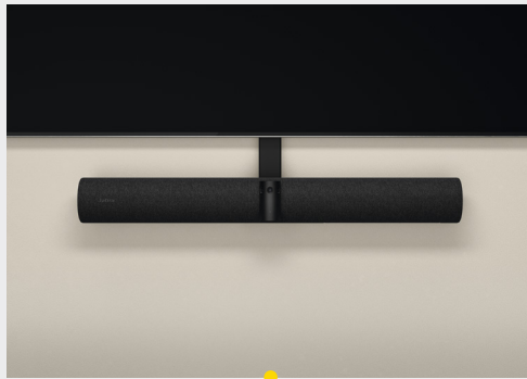
Screen Mount (VESA) 4