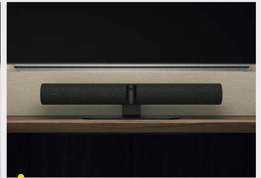
Table Stand 4